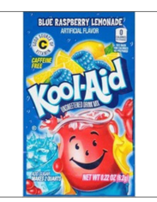
ProdCode: F955475 KOOL-AID ICE BLUE RASPBERRY LEMONADE 48CT

Unit Cost: $0.65 Case Cost: $ 31.20 UPC CODE: 043000955673