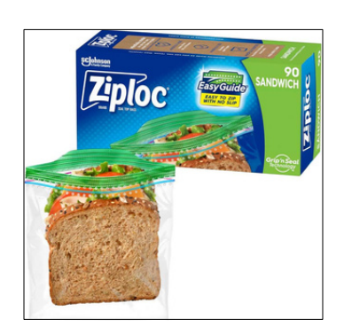
ProdCode: F070070 Ziploc Sandwich Bags 90Ct Easy Guide Inner:12 Master:12 Unit Cost: $3.75

Unit Cost: $6.50 Case Cost: $78.00 UPC CODE: 671407007009