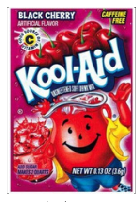
ProdCode: F955673 KOOk-AID BLACK CHERRY48CT (0.13OZ) Inner:4 Master:4 8

Unit Cost: $0.65 Case Cost: $ 31.20 UPC CODE: 043000955673